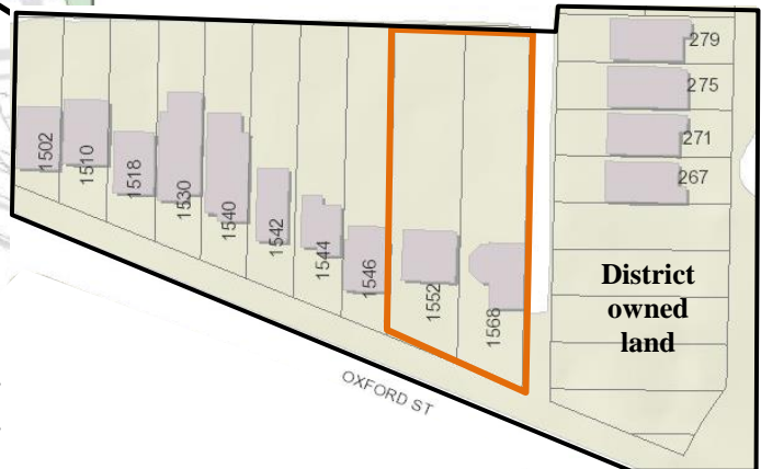
Figure 2. Lower Lynn Land Use Map

← - - - Further Assembly Potential - - - →