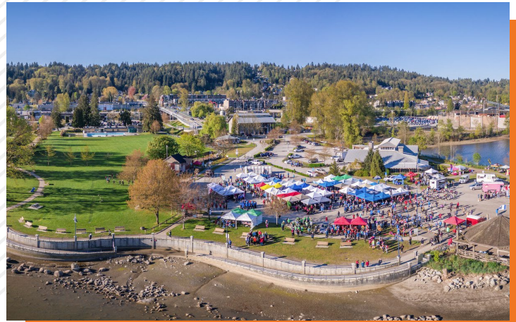
Rocky Point Park