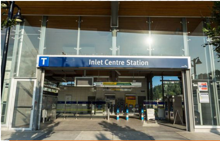
Inlet Centre SkyTrain Station