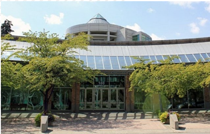
Port Moody Recreation Complex