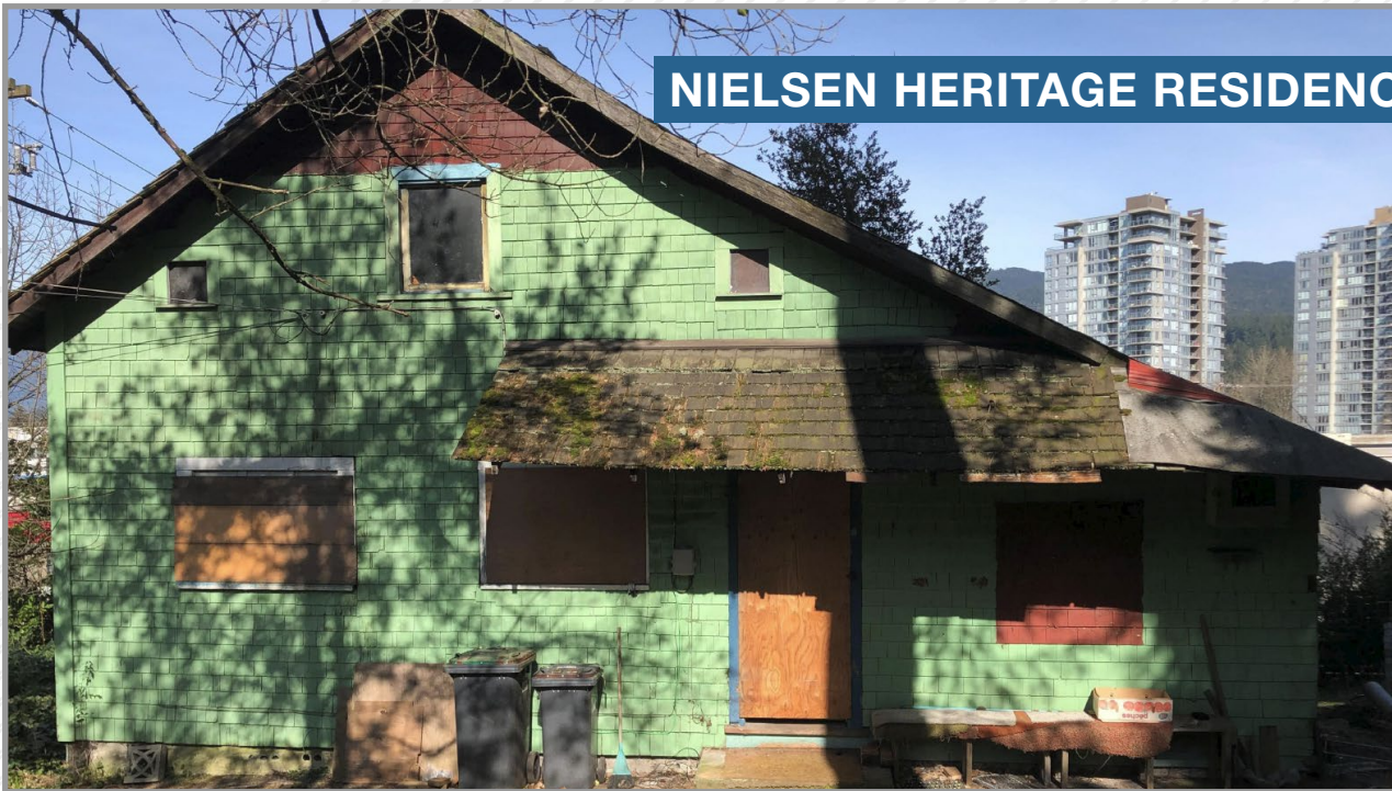
NIELSEN HERITAGE RESIDENCE TODAY

Built circa 1933, the Nielsen Residence is a good example of the type of housing constructed in the interwar era for Port Moody's working population. The house reflects the ongoing development of Moody Centre, the residential neighbourhood situated north of the historic area of commercial and institutional buildings located at the junction of the railway and the waterfront.