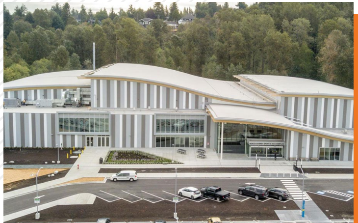
North Surrey Sport & Ice Complex