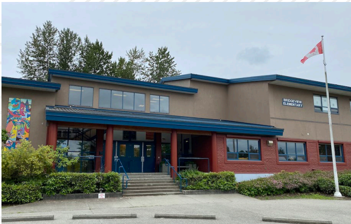
Bridgeview Elementary School