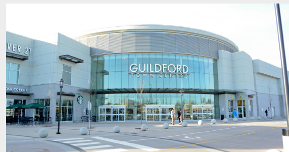
Guildford Town Center