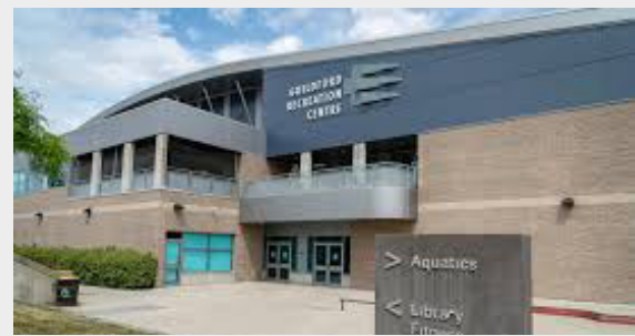
Guildford Recreation Center