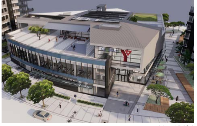
New YMCA Image by Concert Properties.