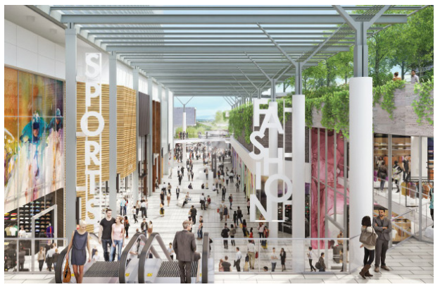
Lougheed Town Centre