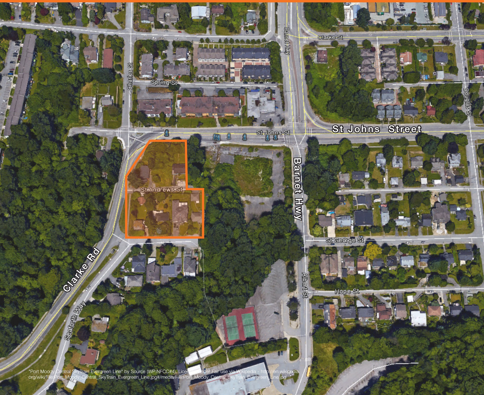
*Port Moody Central Sky Train Evergreen Line"

Grant L. Gardner* 604.420.2600 ext 205 grantgardner@londonpacific.ca